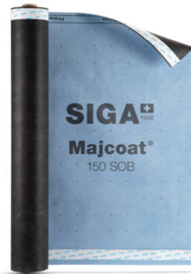
Majcoat® 150 SOB