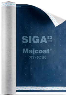
Majcoat® 200 SOB